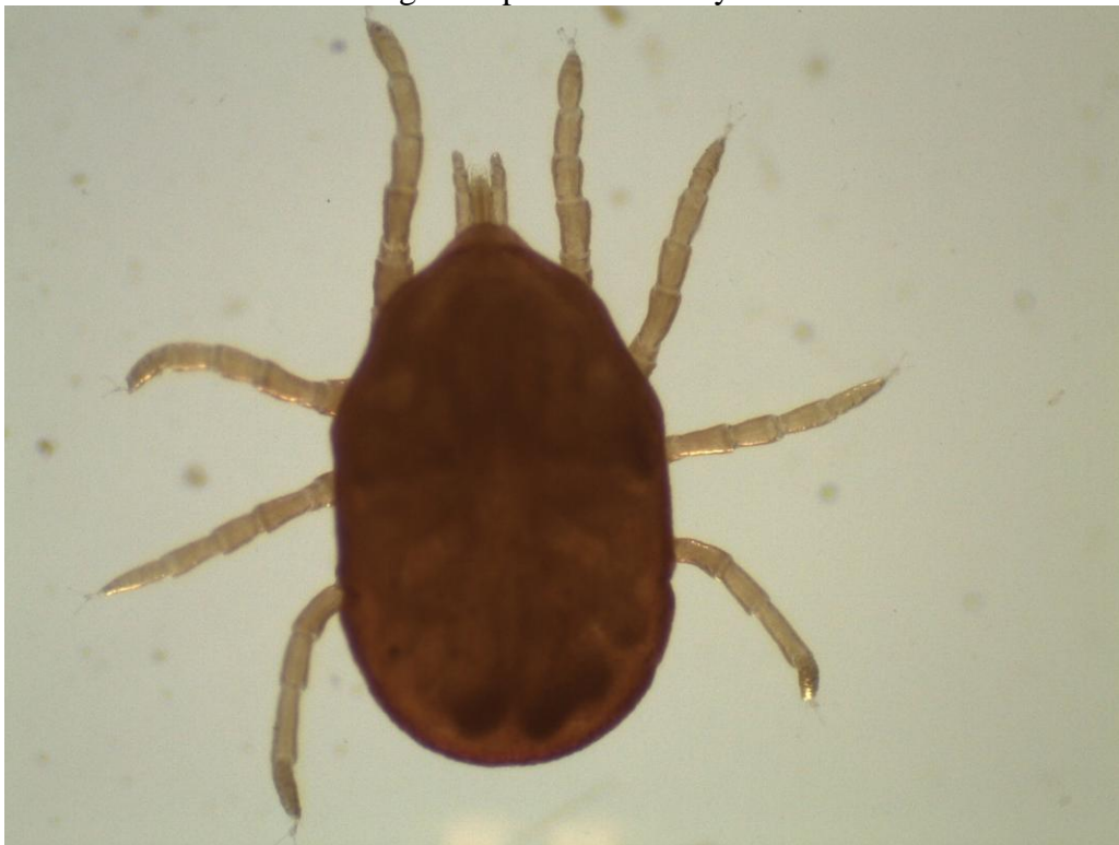
Photo Exhibit 2. Tick Ornithodoros turicata or Ornithodoros parkeri found on desert tortoise CMC-6 during April 2011 annual survey of Translocation Area.