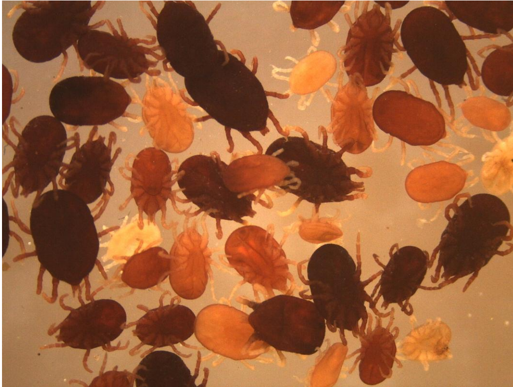
Photo Exhibit 1. Forty-eight tortoise ticks ( Ornithodoros species) found on desert tortoise CMC-6 during the April 2011 survey of the Translocation Area.